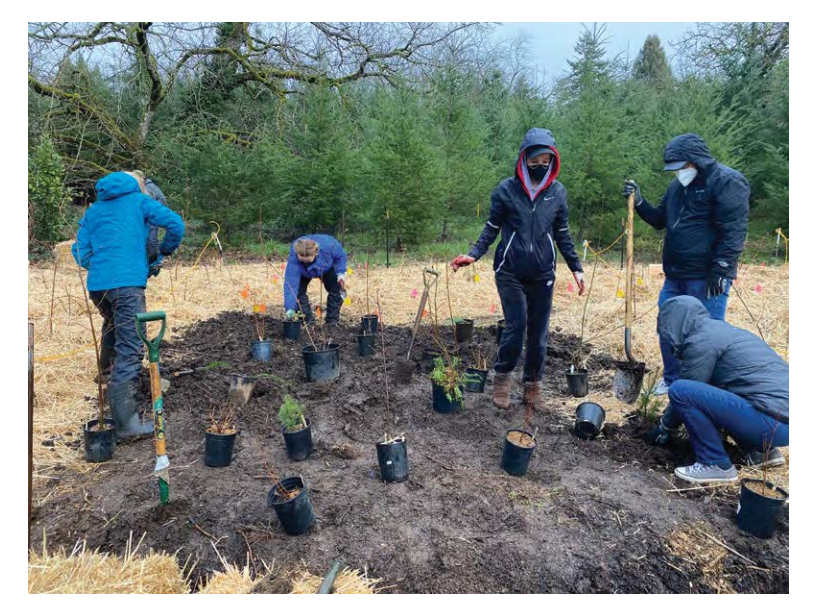
Image 2. Students help plant the 600 trees and shrubs on February 21, 2022.

Hoping to counter my students' climate anxiety, and inspired by a story I heard on the BBC during lockdown, I decided to build a Tiny Forest at my school. A grant from the Planet Stewards program made this possible. A Tiny Forest is a dense planting of 600 native trees and shrubs in an area the size of a tennis court. Begun in Japan and now popular in Malaysia, Brazil, China, Tiny Forests offer opportunities for communities and especially kids to reconnect with nature while improving water, soil, and air quality. Tiny Forests create a carbon sink, an outdoor learning space, and a way to reintroduce a diverse range native plants and the animals they attract. Because the soil is prepared and the trees are planted closely together, the trees grow up to ten times faster than usual. Most importantly, Tiny Forests are a space for hope and reflection for students.