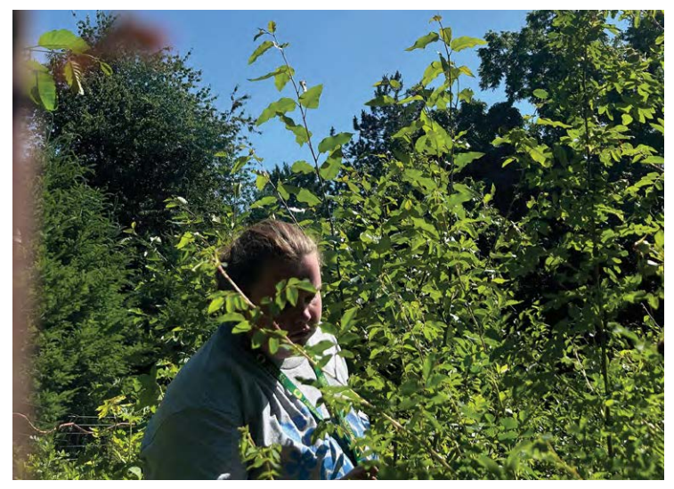
Image 3. A Student Identifies Plants at the Tiny Forest, 2023.