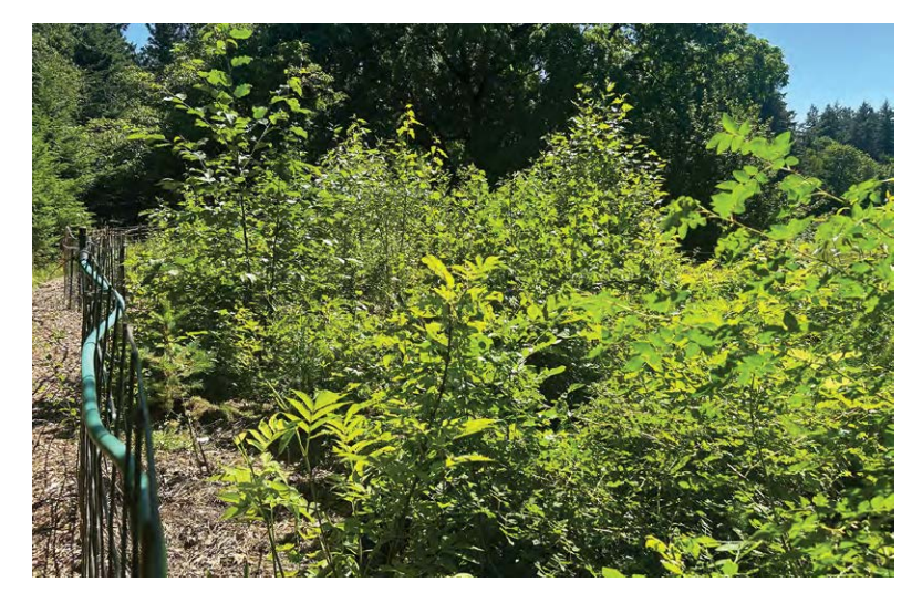
Image 7. The Catlin Gabel Tiny Forest, June 2023, Sixteen Months Since Planting.