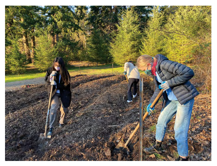
Image 1. Students from the Environmental Action Team, preparing the soil, early 2022.

According to experts, such as psychotherapist Caroline Hickman (Hickman, 2020), climate anxiety in young people can be countered by engaging them in collaborative work that binds them to the environment and demonstrates for them the power of collective action. Inspired by such work at schools in Brazil, China, and Malaysia, and thanks to funding from the NOAA Planet Stewards program, our pre-K-through-twelfth-grade school built a so-called "Tiny Forest" on our campus in 2022. Tiny Forests are dense plantings of native plants in a space about the size of a tennis court. Students took key roles in writing the proposal to the school, choosing the plants, preparing the ground, and planting. A year later, the Tiny Forest has become an outdoor classroom, offering a site for age-appropriate lessons about topics ranging from carbon capture to nature poetry. By sharing the positive effects of reforestation and species diversification, students could articulate the possibility of making small but meaningful impacts on environmental problems. At the Tiny Forest we hope our students might experience empowerment rather than anxiety.