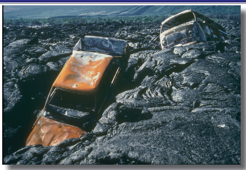
Two automobiles are all that remain after this section of Royal Gardens subdivision was overrun by lava (October 7, 1987). During October the footpath from a road into the housing area was covered, cutting residents off from the few homes that remained.

The ASTHENOSPHERE is in the upper region of the mantle, and is the part that flows like asphalt. It both moves the plates of the Earth and permits their motion. This ability of a solid to flow is called "plasticity".