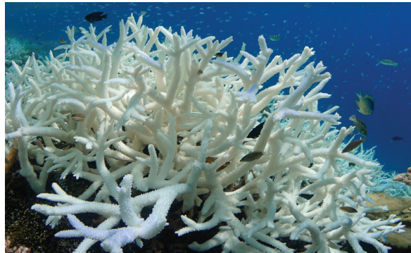
Coral bleaching in the Maldives in May 2016

Bleaching is becoming increasingly common throughout the coral reef regions of the world as a direct result of warming oceans. Nowadays there is at least some limited coral bleaching reported each year especially during summer months, although the major, global events that span multiple oceans are usually associated with natural variability (e.g. El Niño conditions) building on top of seas that are now warmer because of climate change.