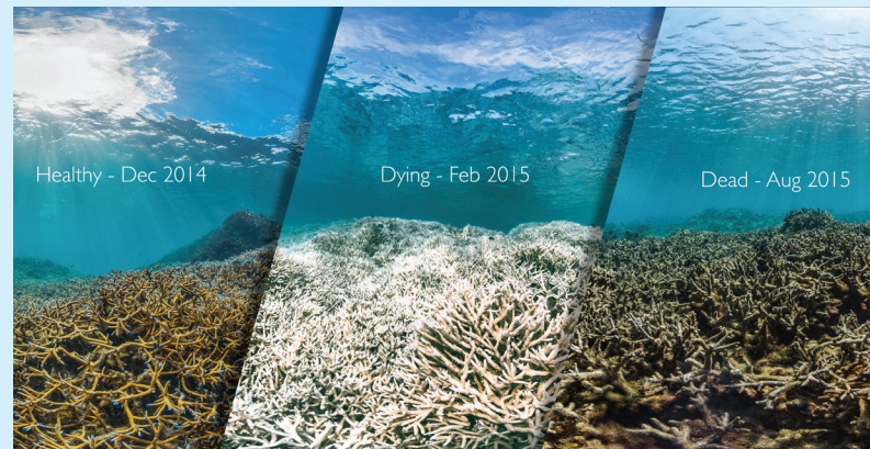
The Death of a Coral Reef. This image shows the same reef in American Samoa before, during, and after a coral bleaching event.

The 3RD Global Coral Bleaching Event 2014-2017 This is by far the longest and most widespread event in recorded history. In 1998,