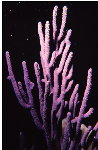
A purple soft coral.

A healthy coral reef ecosystem contains thousands of species, so you can't really include everything in your model. Instead, plan a model that is colorful and interesting, using the images on these pages for ideas. Remember, the main idea is to create a model that will help start a conversation about coral reefs (and is also good to eat!).