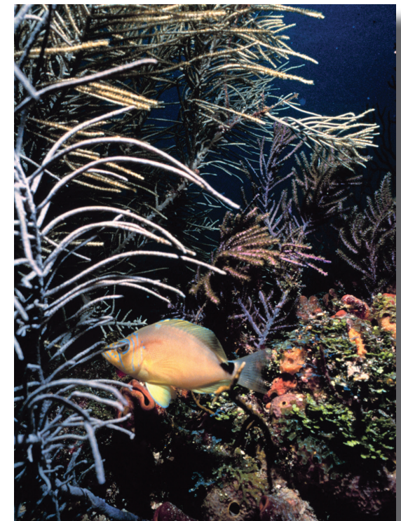
Butter hamlet fish with soft corals.