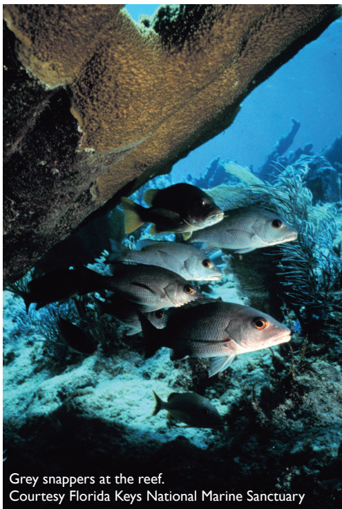
Grey snappers at the reef.

4. Show your model to your friends, parents, school, or other groups, and talk about why coral reefs are important, why they are in trouble, and what we can do to help save them. If you are using your model at school, your teacher may be able to arrange for you to make a presentation about coral reefs to another group of students, perhaps a younger class. When you have finished your presentation, you can say, "Now it is time for us to have a direct interaction with this model reef." Which means everyone can eat the cake!