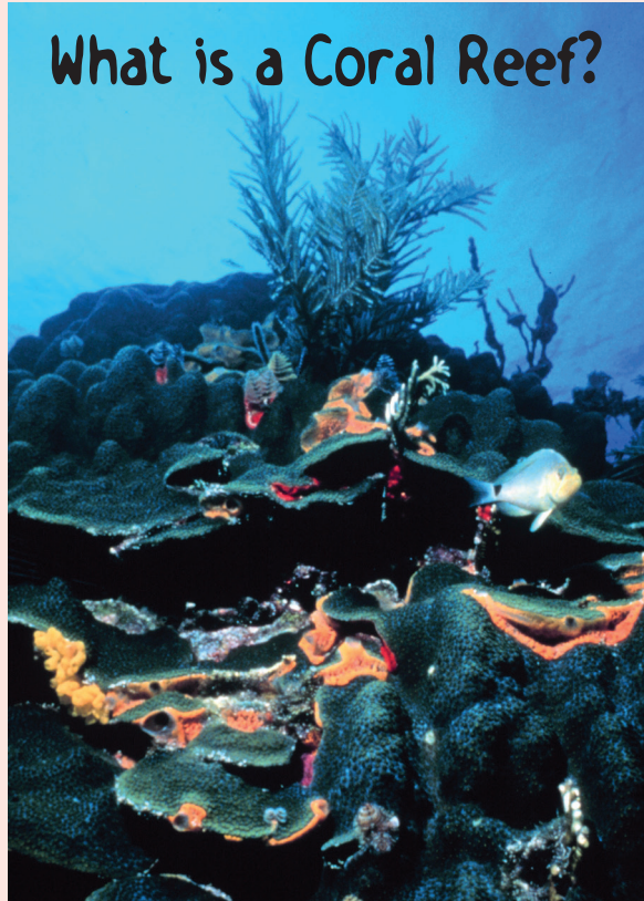
A colony of star coral.

As the polyps grow and multiply, the coral colony may become shaped like boulders, branches or flattened plates. Some corals form tall columns, others resemble mushrooms, and some simply grow as a thin layer on top of rocks or the skeletons of dead corals.