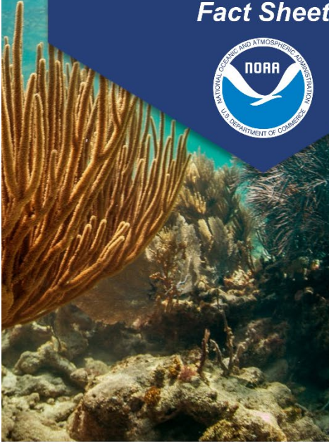
Florida Keys National Marine Sanctuary