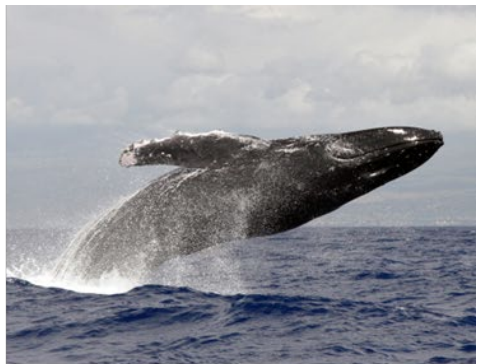
Greater Farallones National Marine Sanctuary