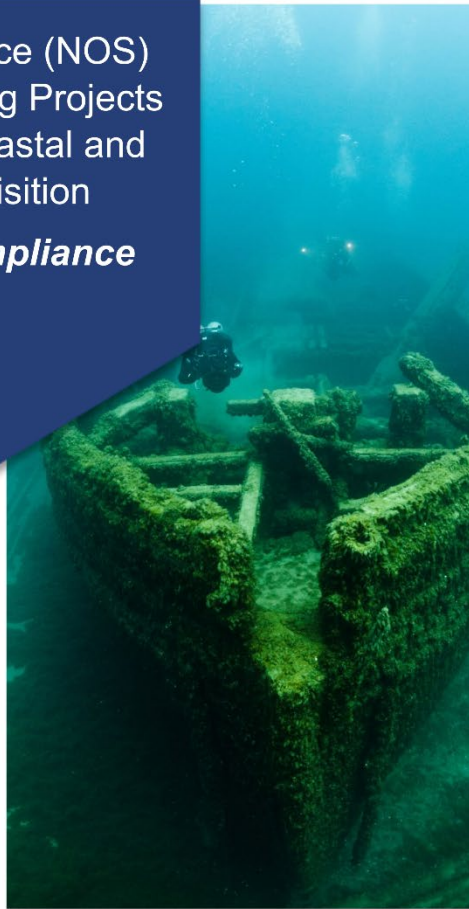
Thunder Bay National Marine Sanctuary