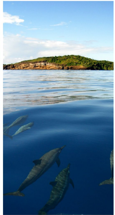
National Marine Sanctuary of American Samoa