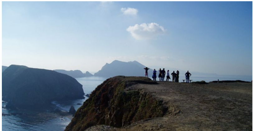
Channel Islands National Marine Sanctuary

The national marine sanctuary system includes 15 national marine sanctuaries encompassing more than 600,000 square miles of marine and Great Lakes waters from Washington state to the Florida Keys, and from Lake Huron to American Samoa. They contain deep ocean and cold freshwater habitats of aquatic life, kelp forests, coral reefs, whale migration corridors, deep-sea canyons, historically significant shipwrecks, and other underwater archaeological sites. Each sanctuary is a unique place that has been afforded special protection.