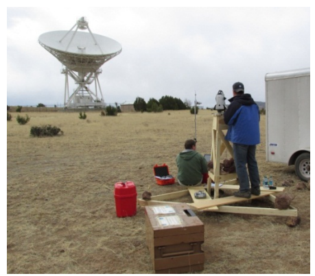
NOAA National Geodetic Survey employees take survey observations to a radio telescope operated by the National Radio Astronomy Observatory using a high precision tacheometer.

Whether it is the Nation's nautical charts, environmental monitoring or socioeconomic tools, NOS and its partners integrate science and services to provide actionable intelligence. Informed decision makers, both public and private, are able to make informed choices on their use and stewardship of coastal resources.