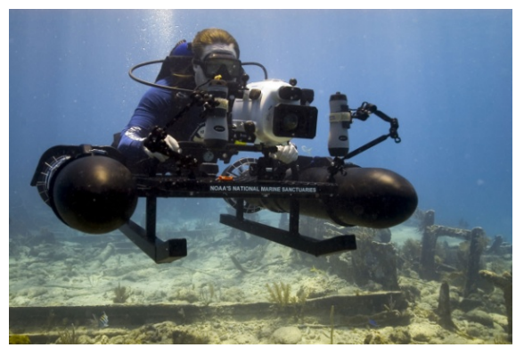
NOAA archaeologist photographs a wreck site in the Florida Keys National Marine Sanctuary.

NOS works to conserve marine areas and preserve economic benefits of special places through its coastal management and place-based conservation programs. NOS provides leadership for state and local coastal management efforts across the nation and is the primary conduit for data and services at NOAA to support informed coastal decision making. NOAA's national marine sanctuaries are America's primary instrument for place-based conservation of special marine places in offshore areas.